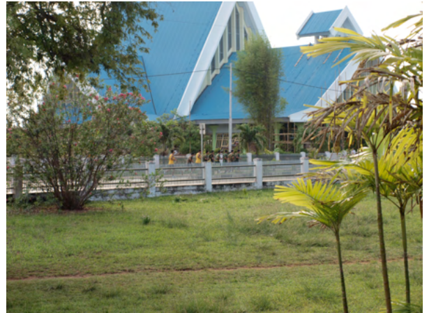
Photo 2: TNI troops singing loudly while jogging past a church in Merauke, 2008

According to Watson, “crowd-control is probably the most-used psychological counter-insurgency technique. ... The effects of police formations and actions on crowds and the use of special equipment and techniques ... produce desired effects”. 85 This technique is exercised frequently in West Papua by security forces via “sweeps” of towns and villages searching for “separatist” materials or weapons on politically important West Papuan dates such as December 1 st (West Papuan national day), 86 and the turning out en masse of security forces to incite awe and fear. For example, when in Wamena in 2008, one of the authors was witness to the sudden and unnerving show of approximately 20 open backed police and army vehicles, packed with at least ten troops and officers each, driving around the town with their sirens blaring, then parading before shutting down a West Papuan church-opening ceremony (see Photograph 3). That “the surprise appearance of a large unit of specially equipped police in full view of the mob can have a huge psychological impact” 87 was confirmed by this author in Wamena when one of the rapidly scattering crowd of celebrators whispered that the security forces shut down the town and cut off roads like this regularly as a drill.