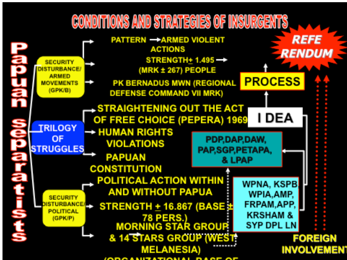
Figure 2: Slide 7, Anatomy of Separatists . The bottom of the slide, irreproducible here, reads "(Organizational Base of Papua Taskforce)"

Slide 7 is also reproduced here (Figure 2) as it shows the TNI's conception of the West Papuan nationalist or "separatist" struggle: its strategies and goals. The overarching goal is said to be "referendum" – demand for a replay of the flawed 1969 Act of Free Choice. There is a direct link here to "Foreign Involvement", implying that the political and military actions engaged in by the "separatists" are pitched, at least in part, to an international audience. Like the long struggle in East Timor, the Indonesian state will never be defeated militarily on the ground, but in the arena of world opinion the likely outcome is not so clear.