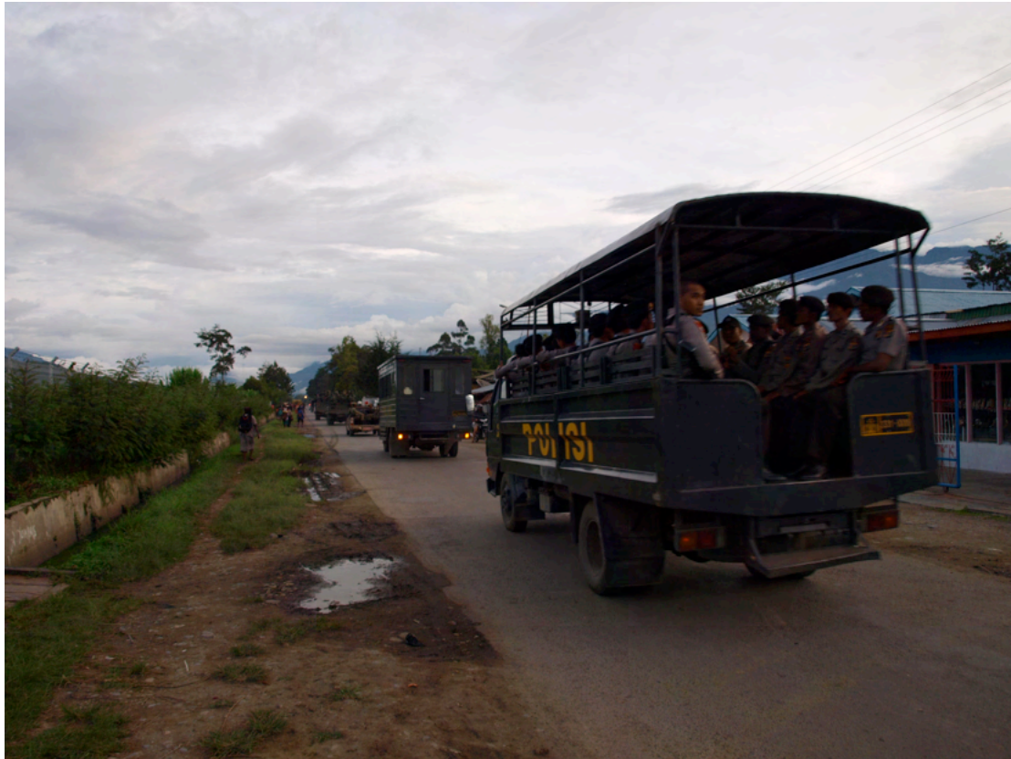
Photograph 3: Police and Army turn out en masse to shut down a church celebration in Wamena, 2008