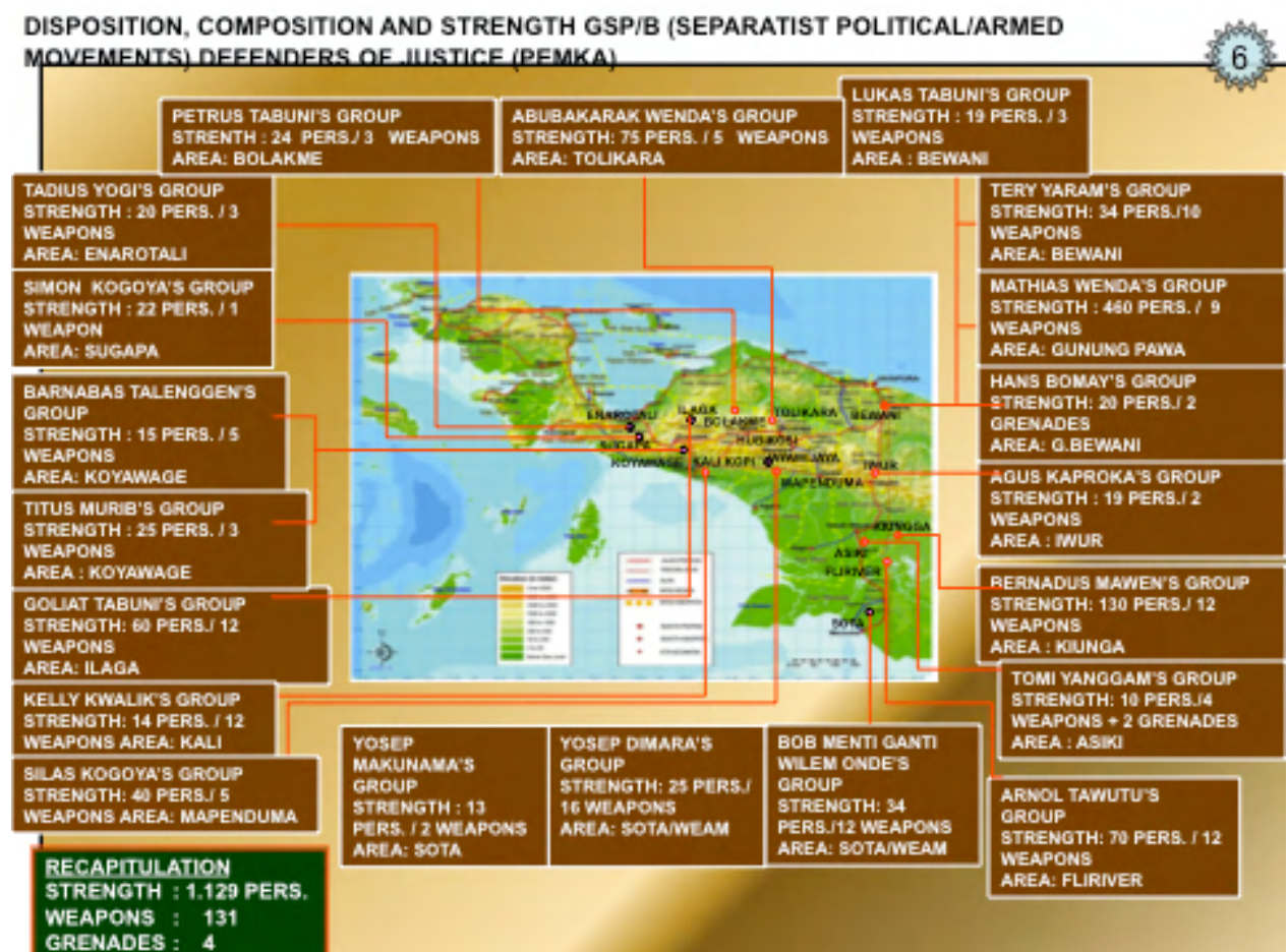
Figure 1: Slide 6, Anatomy of Papuan Separatists