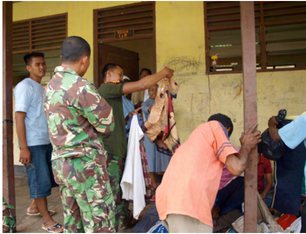
Photo 1: TNI troops with second-hand clothes brought by a Merauke church to villagers, 2008