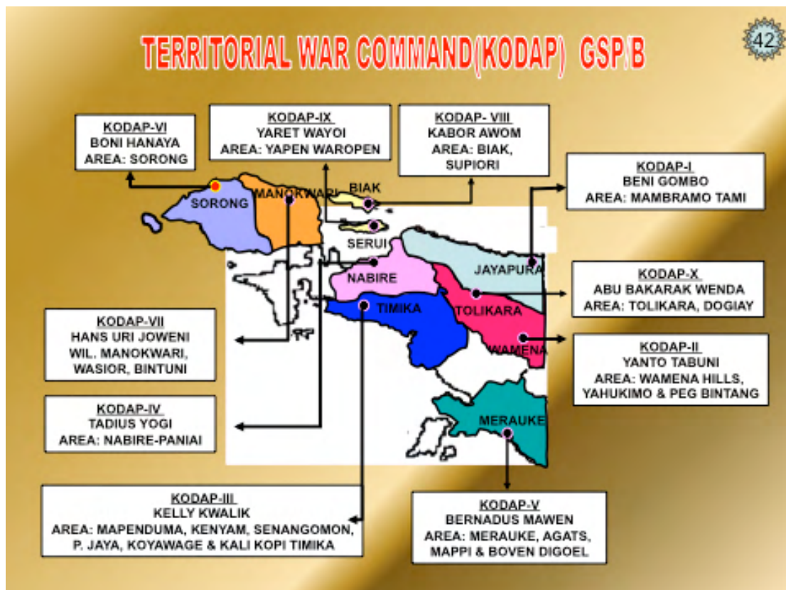
Figure 4: Slide 42, Anatomy of Separatists