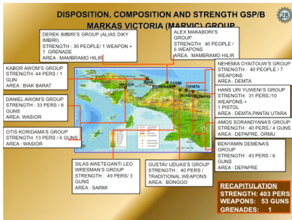
Figure 3: Slide 28, Anatomy of Papuan Separatists

Slide 28, reproduced below, shows the “Disposition, Composition and Strength of GSP/B Markas Victoria (MARVIC) group”. 15 There are 11 groups consisting of 403 persons with 53 guns and one grenade. These groups are, on the whole, smaller and less active than the PEMKA groups. The largest group is the Sarmi command under Silas Awete, although no activity is recorded for this group since 2004. Three commands have no bio-data; their files containing only the statement “there have been no conspicuous actions as of yet”.