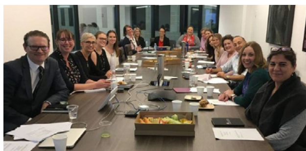
NSW Clinic co-ordinators at the 2nd Air Academy meeting

Read more about the Academy: https://www.projectairstrategy.org/academy/index.html ●