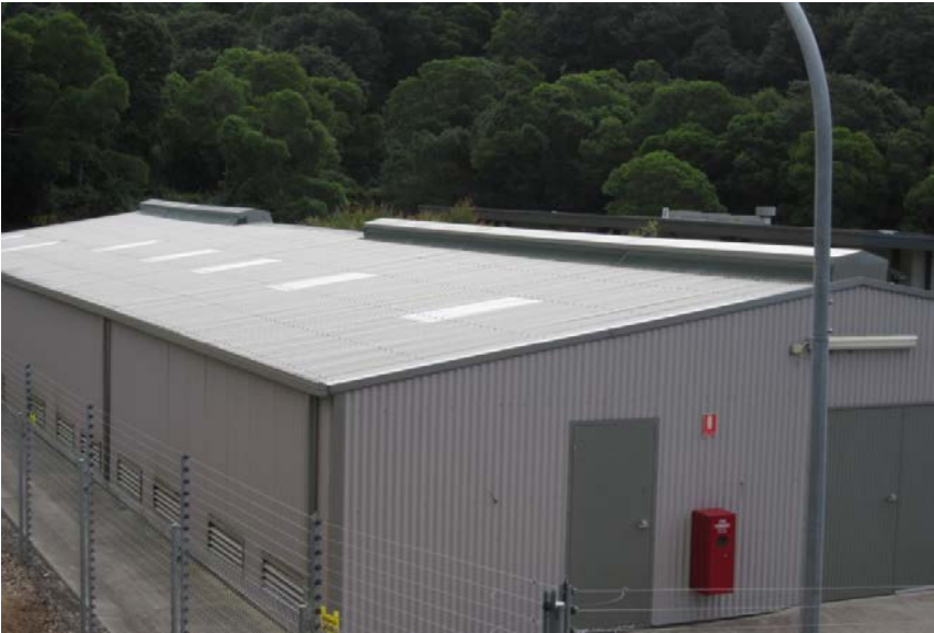
South east corner