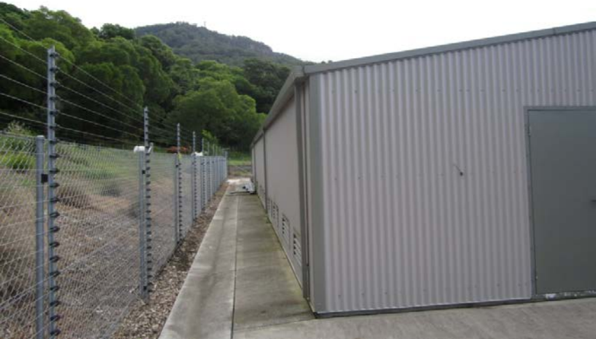
Shed located in close proximity to electric fence