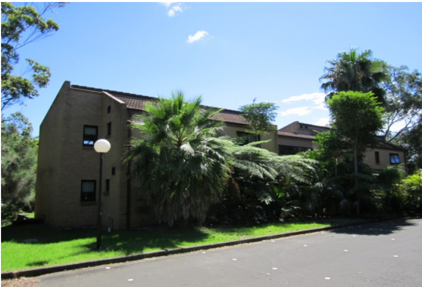
South west corner