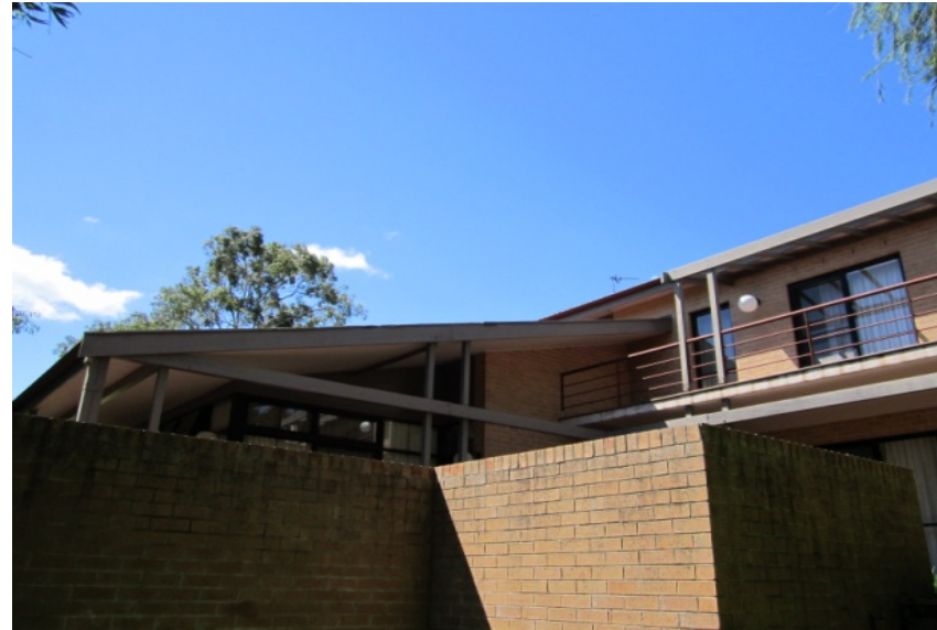
North Western side