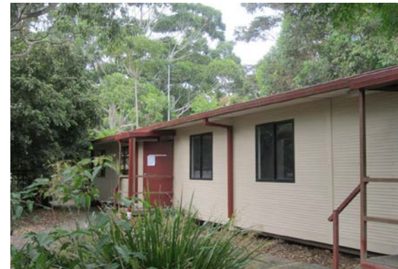
Classrooms 57 & 58