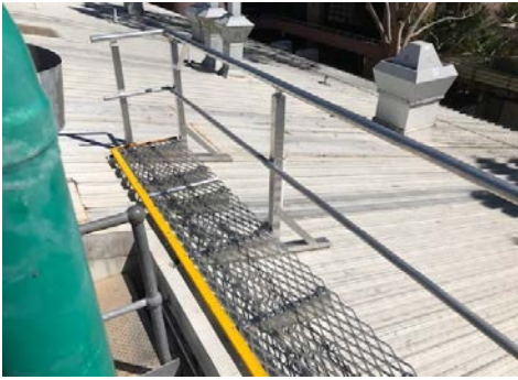
B35 new access platform