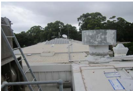
Northern wing - looking back towards the southern wing