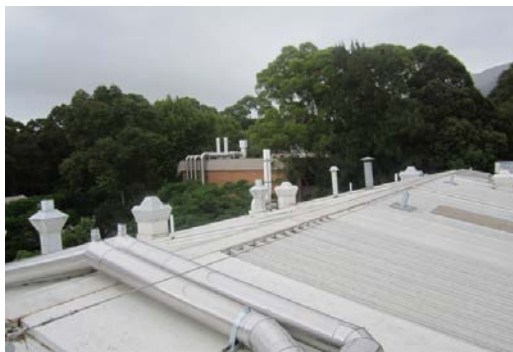
Northern wing - looking west towards northern wing of Building 15