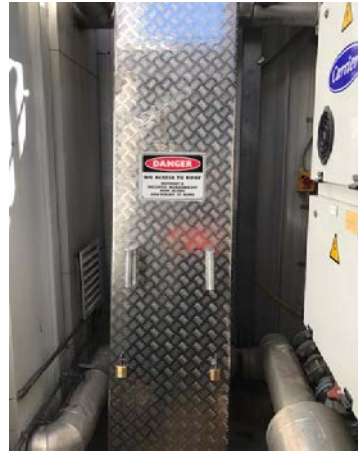
B35 New ladder cover