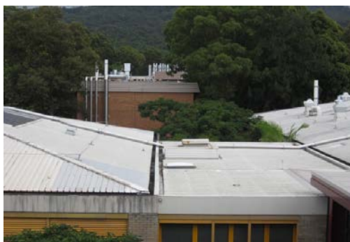
View of link between northern and southern wings