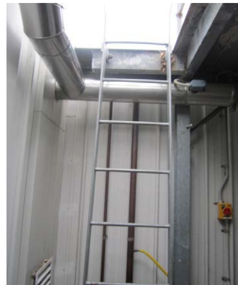
Permanent ladder to northern wing roof