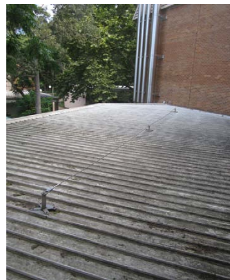
Roof over link between Building 15 and 35