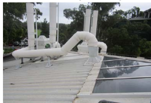
Northern wing - eastern view showing glass skylight over stairwell