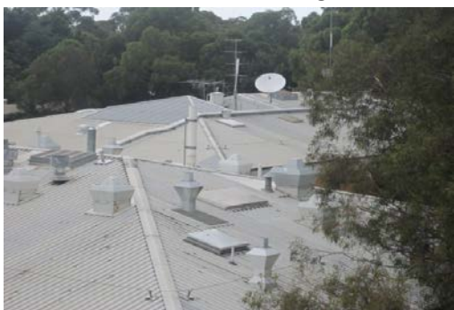
Northern wing and Southern wing roof access looking south from Building 41