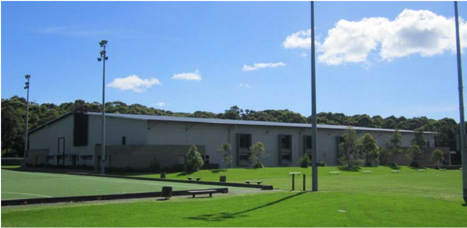
Sports Hub - southern aspect