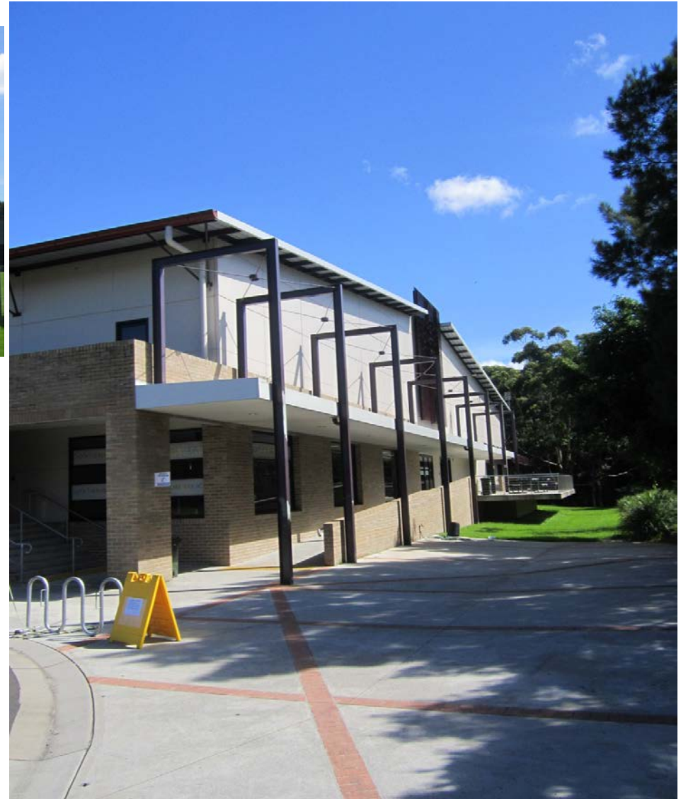
Sports Hub - eastern aspect