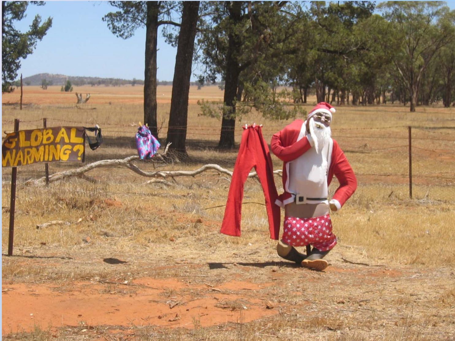
On the road to Talimba...