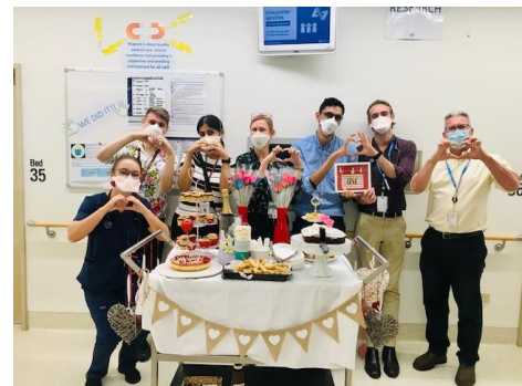
Specialist and supportive Palliative Care team at Gold Coast University Hospital

Despite the disruptions in the majority of PCOC-registered services, outcomes have been maintained in most services that received an outcomes report in 2021.